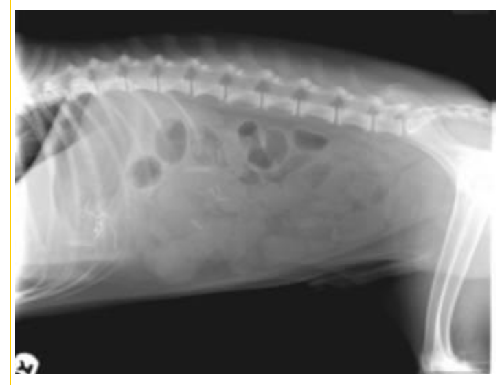
The dark spots at the top of the abdomen represent a gas pattern that is consistent with plication from a linear foreign body.

The linear foreign body is particularly difficult to diagnose. Strings are too small to see on radiographs and cloth does not show up on radiographs. Checking under the tongue for a string is important but not always possible, and even if a string is there it is not always visible. Frequently the only hint is evidence of plication on the radiograph or by ultrasound and even then the pattern is likely not going to be definitive. The decision to go to surgery is likely going to have to be made based on how sick the patient looks and innuendo from the radiographs.