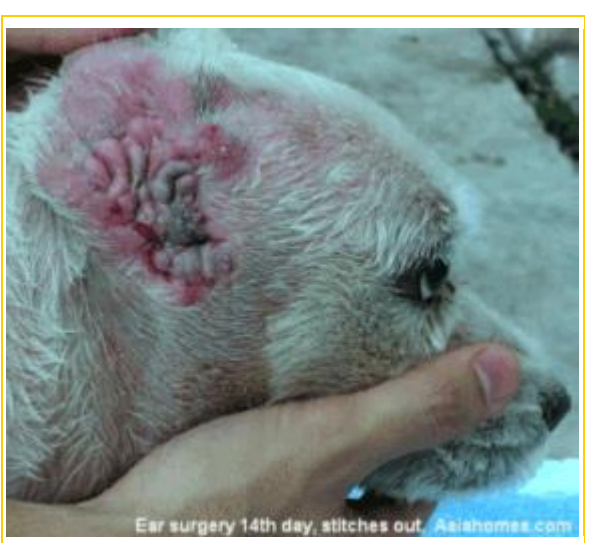
Note the proliferation of tissue in the ear canal. Bacterial discharge can hide in all the nooks and crannies. The vertical canal has been opened so as to facilitate cleaning.

If the canal becomes so scarred that it is practically closed, ablation may be the final option. In this surgical procedure, the entire ear canal is removed and healthy tissue is allowed to grow in. These procedures are last resorts after severe infection has made effective medical treatment impossible. Ablation is a procedure that not all veterinarians are comfortable performing, so discuss with your veterinarian whether a referral to a specialist would be best for you and your pet. Although surgery is expensive, dogs with chronic severe otitis usually require no further ear treatment for the rest of their lives.