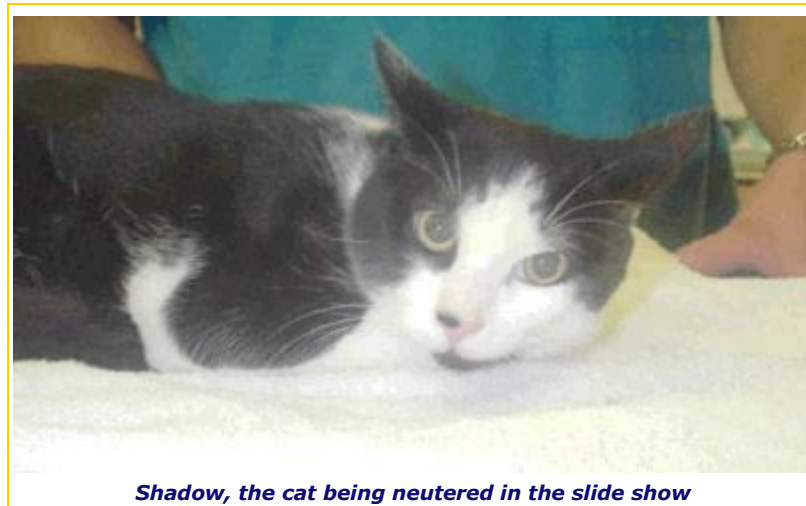
Shadow, the cat being neutered in the slide show

We put together a slide show to walk you through a feline neuter. We invite you into the surgery suite to see how it's done. Be aware that these are actual surgical photographs.